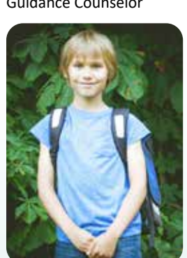
"That just lifted a weight off my shoulders!" -Sunbright Parent

"Each student brought their backpacks to school the first day of class and had their materials organized and ready for class. Students were proud of their materials and showed their pride by participating in class." - Roya Mitchell, Guidance Counselor