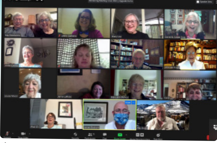
After some trial and error, and then a bit more trial and error, members of ADFAC's Bow Tie Committee are now seasoned Zoom professionals.

Folks at ADFAC are coping with Covid-19 in many ways, including caring and comedy. In between helping clients and connecting with supporters, a little comic relief can go a long way! The power of laughter, along with the great relationships we share with each other and the community, have definitely made 2020 more bearable