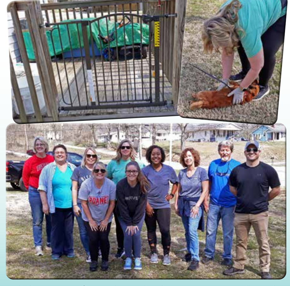
Leadership Roane County first started in 1985 through Roane State Community College, and is co-sponsored by Roane County county Chamber of Commerce.