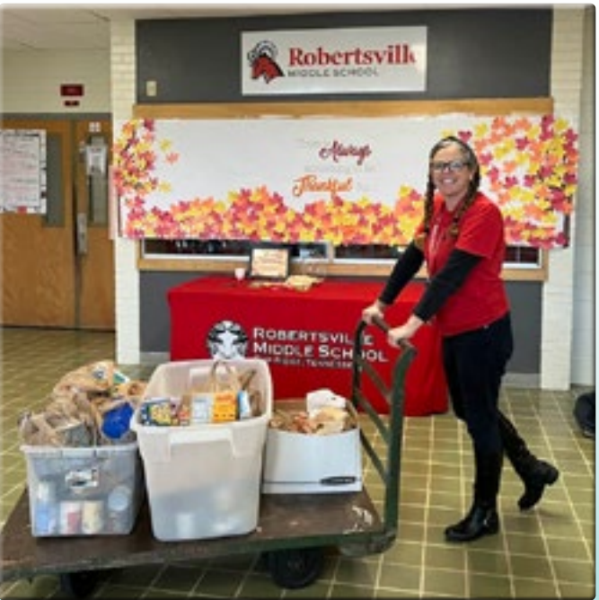
Thank you, Robertsville Middle School students and staff, for the annual food drive to stock ADFAC’s Crisis Cupboard!

American Museum of Science & Energy Apple Blossom Cafe & Catering Buff City Soap DoubleTree Estate Sale Professionals Explore Oak Ridge First Cumberland Presbyterian Church Knox Area Rescue Ministries Leidos Mortgage Investors Group ORUD PEO Sisterhood Chapter G Prayer Pantry Robertsville Middle School Students & Staff St. Stephen’s Episcopal Church